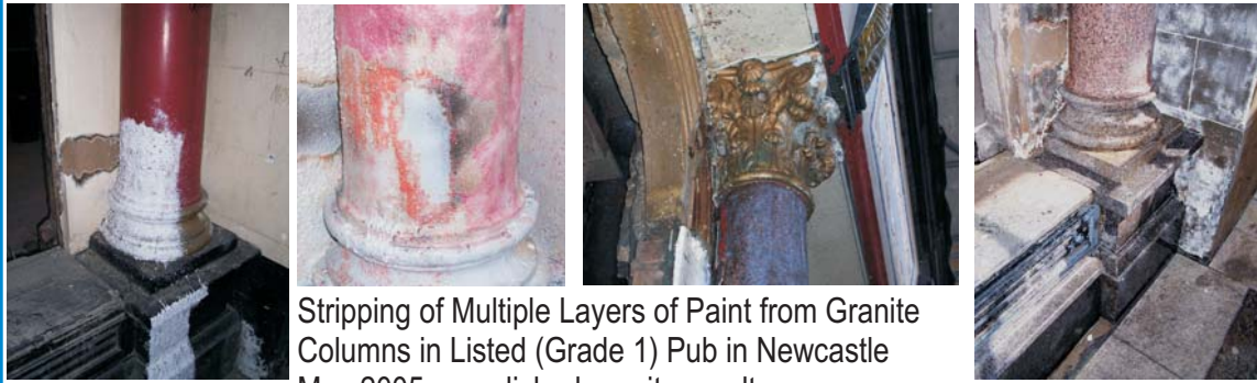
Stripping of Multiple Layers of Paint from Granite Columns in Listed (Grade 1) Pub in Newcastle May 2005 - a polished granite result.

See also www.ashrose.com & www.surfprep.co.uk for more examples