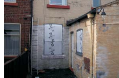
Paint being cleaned from Brickwork - Sheffield 2002 - note test patch and window protection